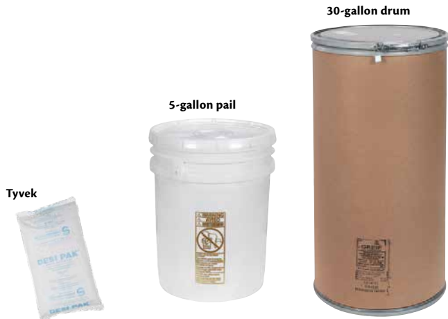
Priced per Package

Dust-free: Tyvek bags are ideal for applications where dust must be kept to a minimum. Examples include computer components, packaged chemicals, and photographic and optical devices.